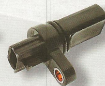
Nissan Camshaft Sensor PC464