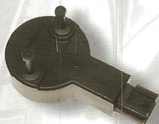
Ford Camshaft Sensor PC321