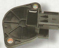
Chrysler Camshaft Sensor PC475