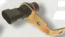
GM Crankshaft Sensor PC123