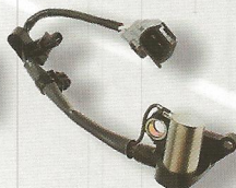
Toyota Crankshaft Sensor PC78